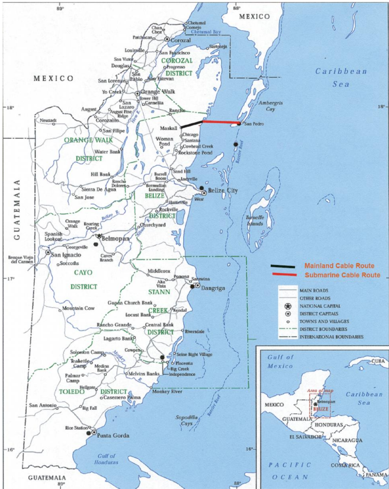
Fig: 1.0: Project Corridor Location Map